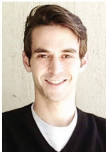
Left: John Sessions